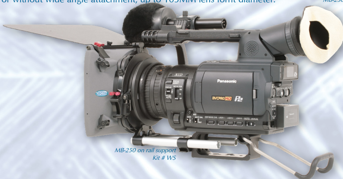
MB-250 on rail support Kit # WS

For more available kits and detailed information please see our website or catalog.