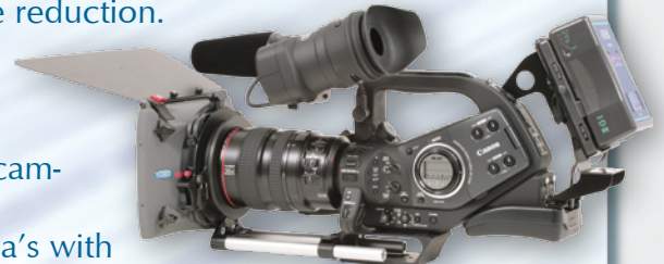
MB-250 on rail support Kit # WS-CS