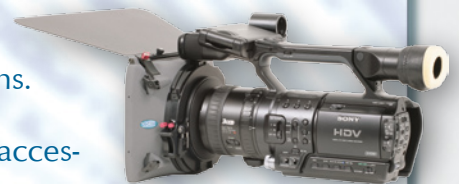
MB-250 clip-on Kit # C-72SF